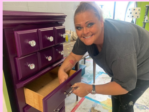
refurbish furniture and much more!