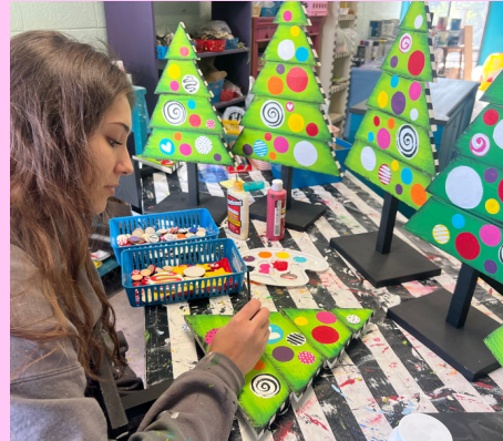
Women are employed to paint home decor items...