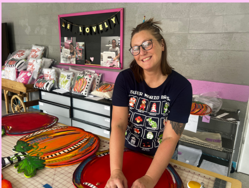
sew products and coordinate the sales process...

2021- $146,000 2022- $170,000 2023- $201,000